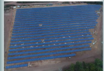
NetCap South Solar Facility South Windsor 1540 Sullivan Ave South Windsor, CT 06074

Town of South Windsor Municipal, Residential and Business Energy Plan. July 2019